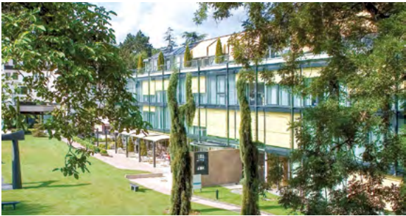
CLINIQUE DES GRANGETTES