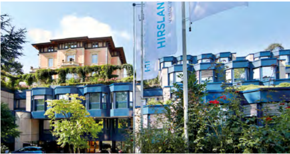
KLINIK IM PARK