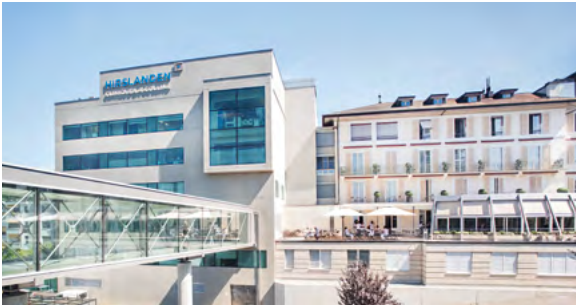
CLINIQUE LA COLLINE